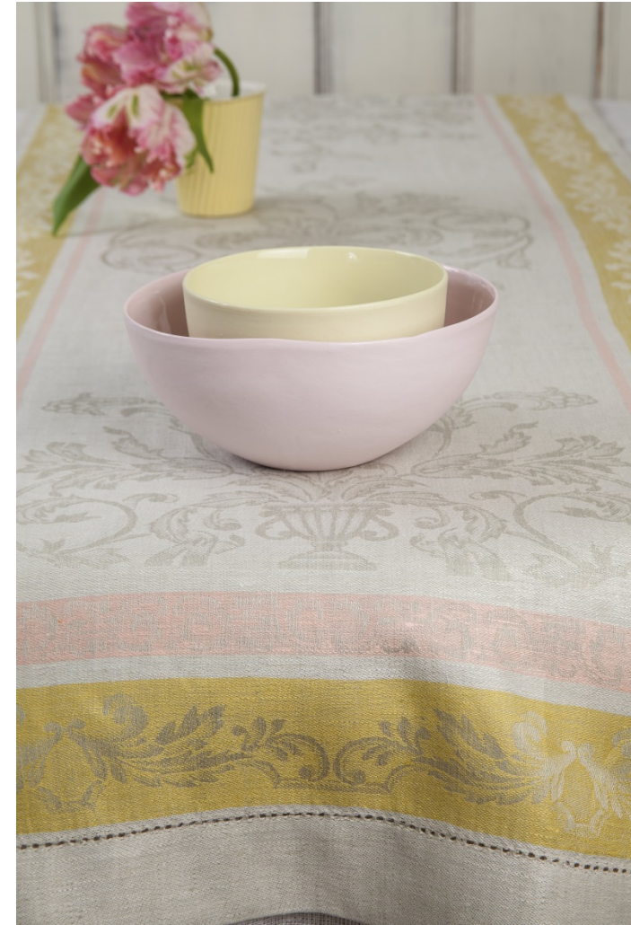
Pastel Peach/Lime runner