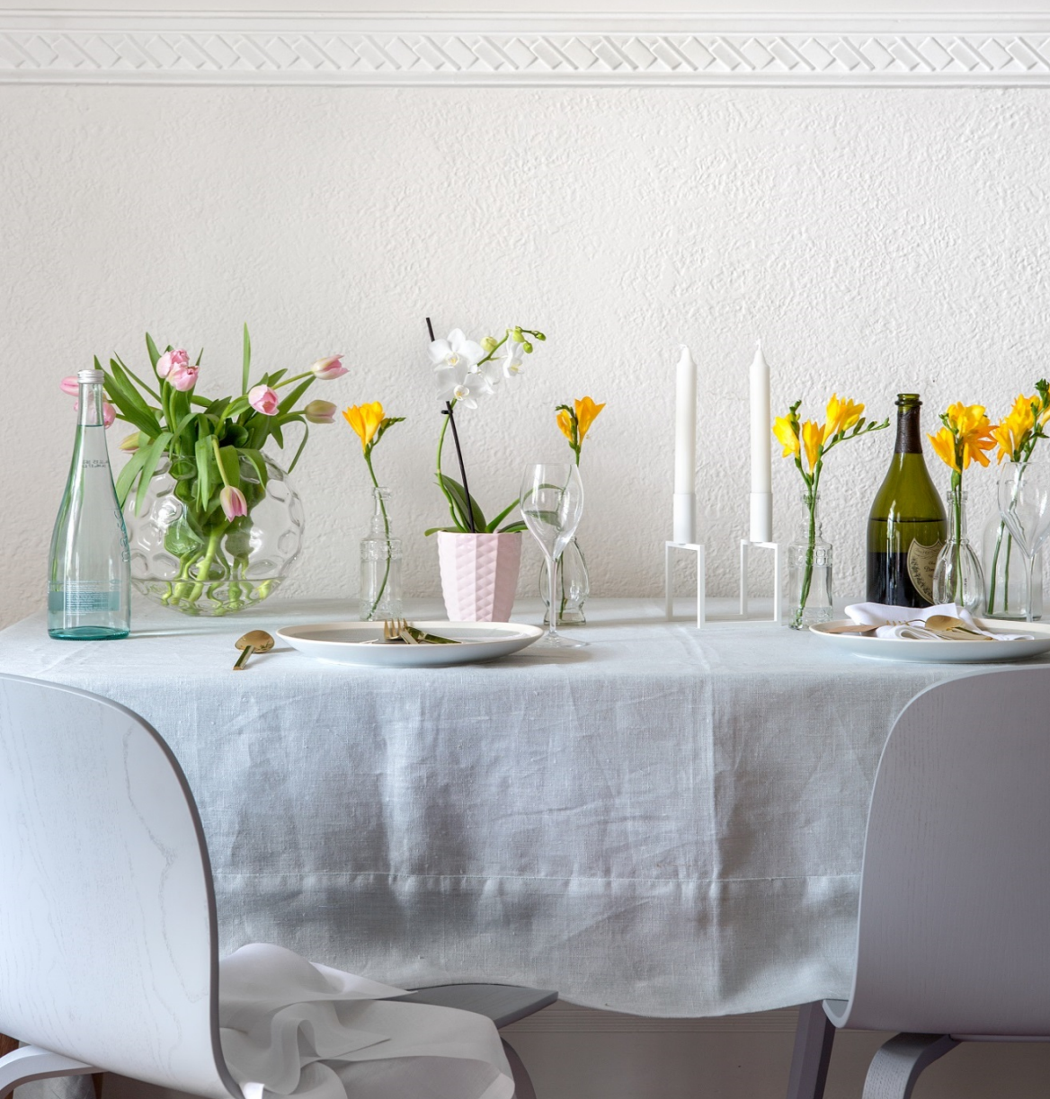
TABLE LINEN CATALOGUE 2022