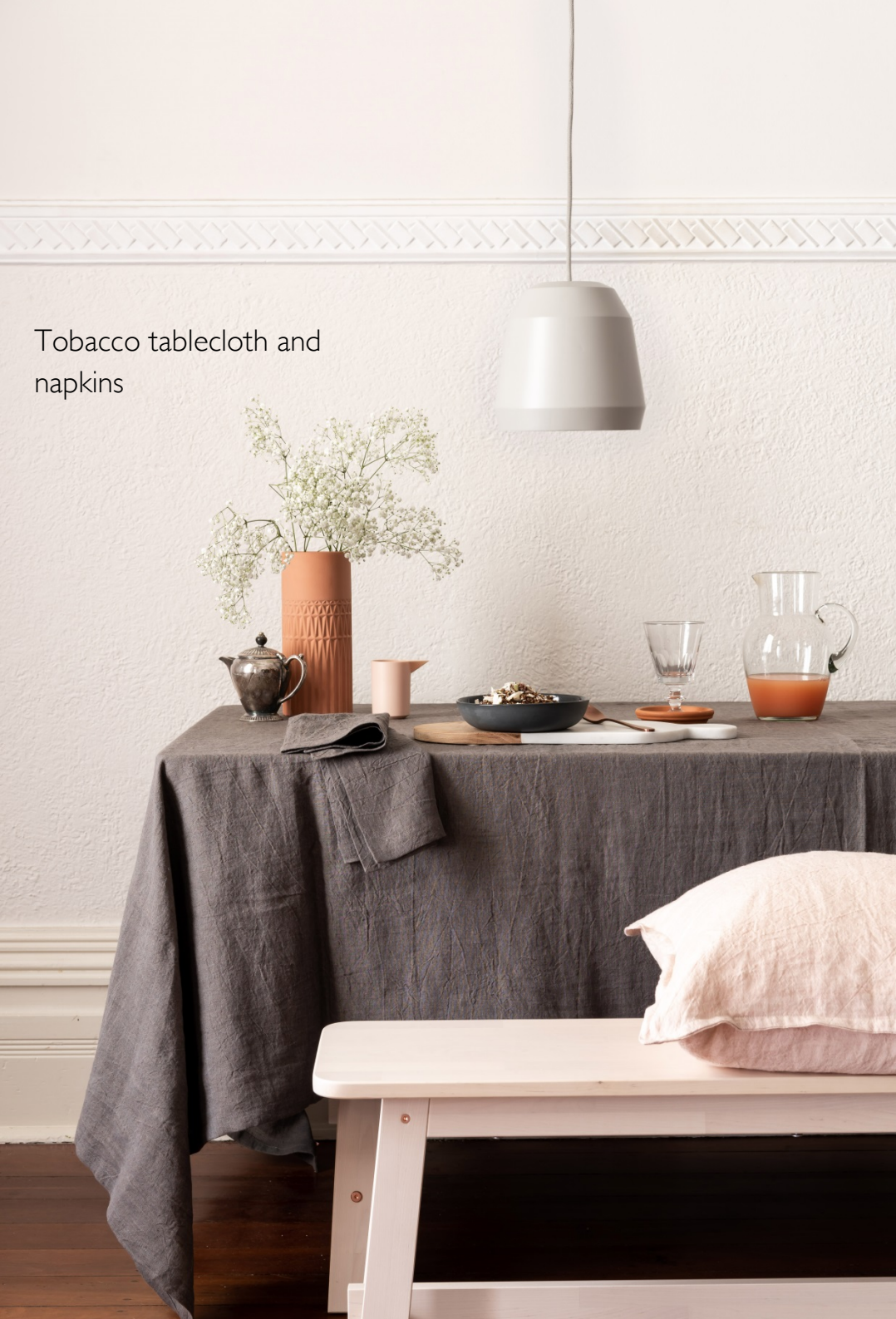
Tobacco tablecloth and napkins