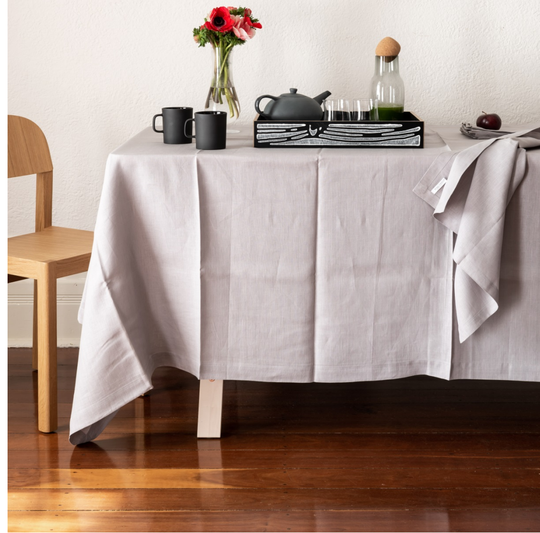
Stone Grey tablecloth and napkins