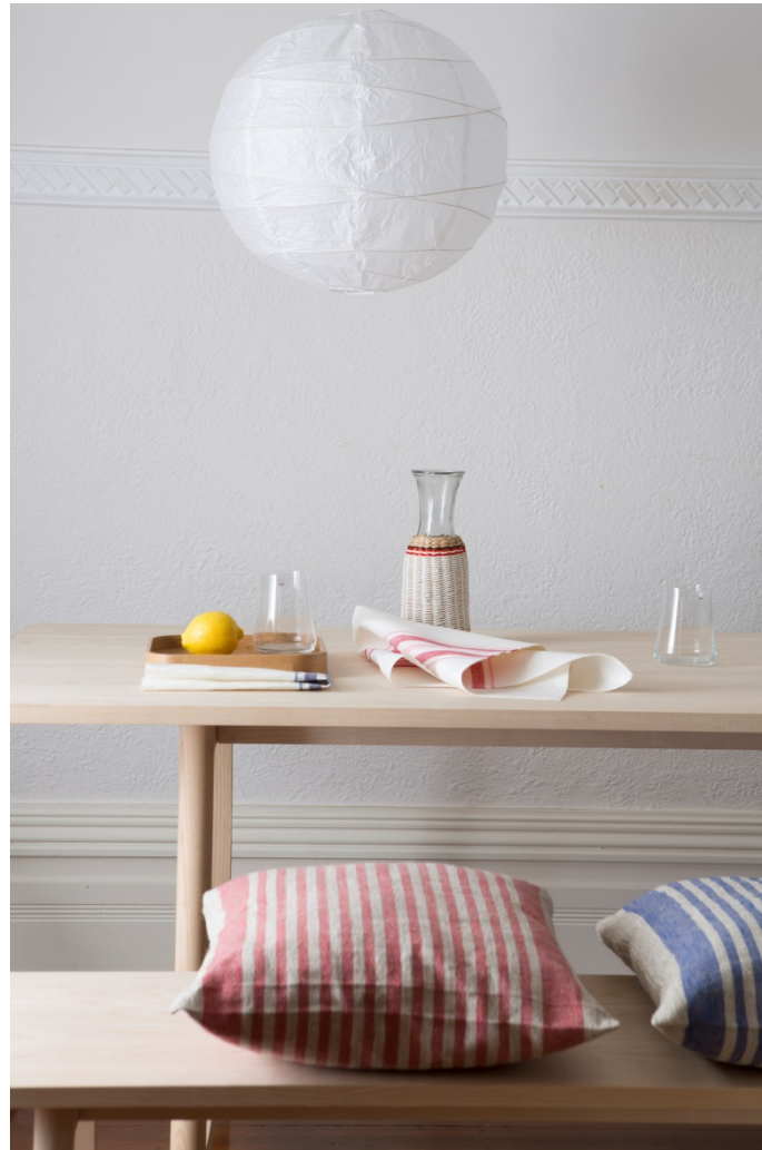
Red Striped and Blue Striped Cushions