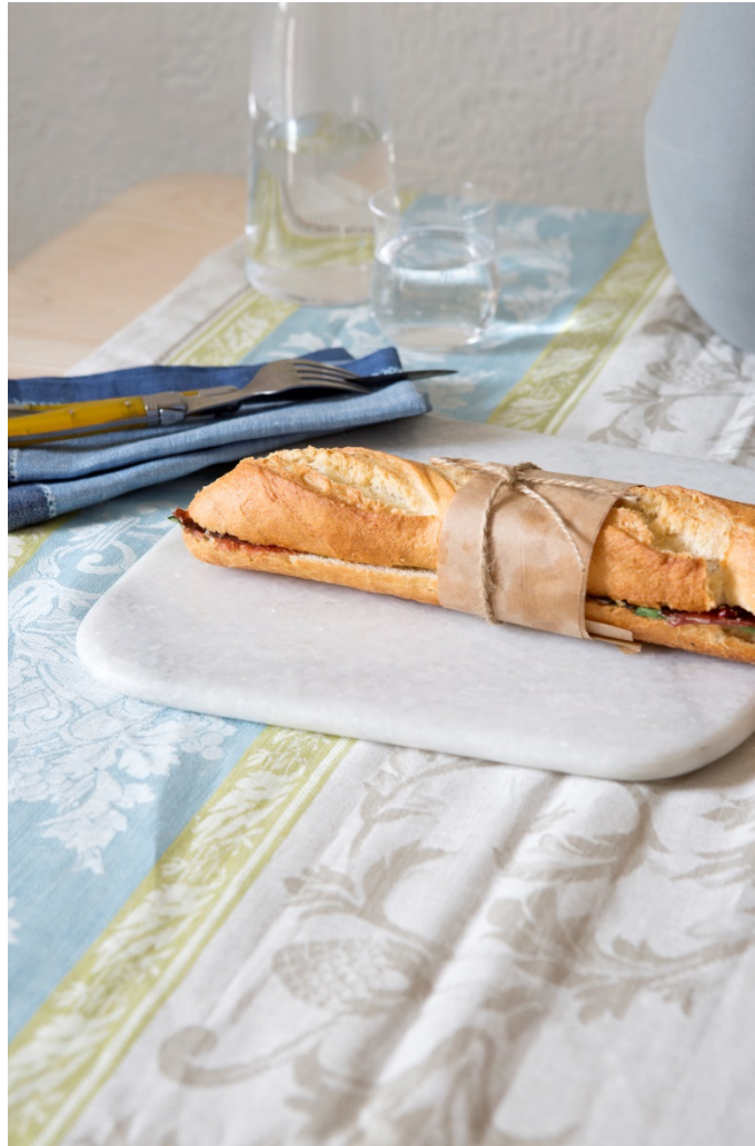
Pastel Blue/Green tablecloth and Wedgwood Blue napkin