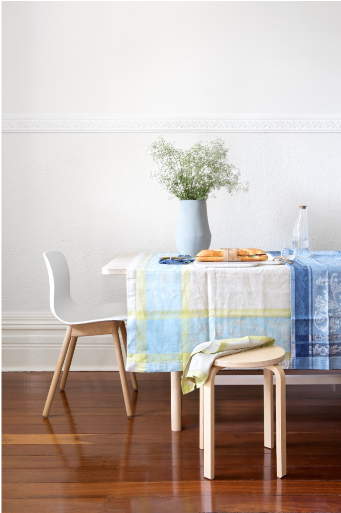
Pastel Blue/Green tablecloth and Wedgwood Blue runner