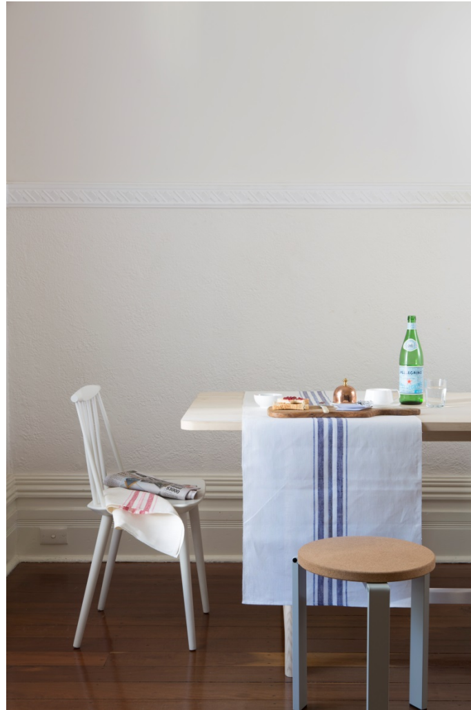
Red Striped napkin, Blue Striped runner