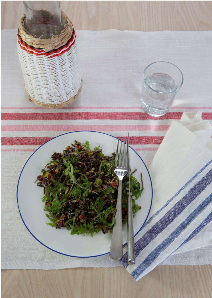
Red Striped runner, Blue Striped napkin