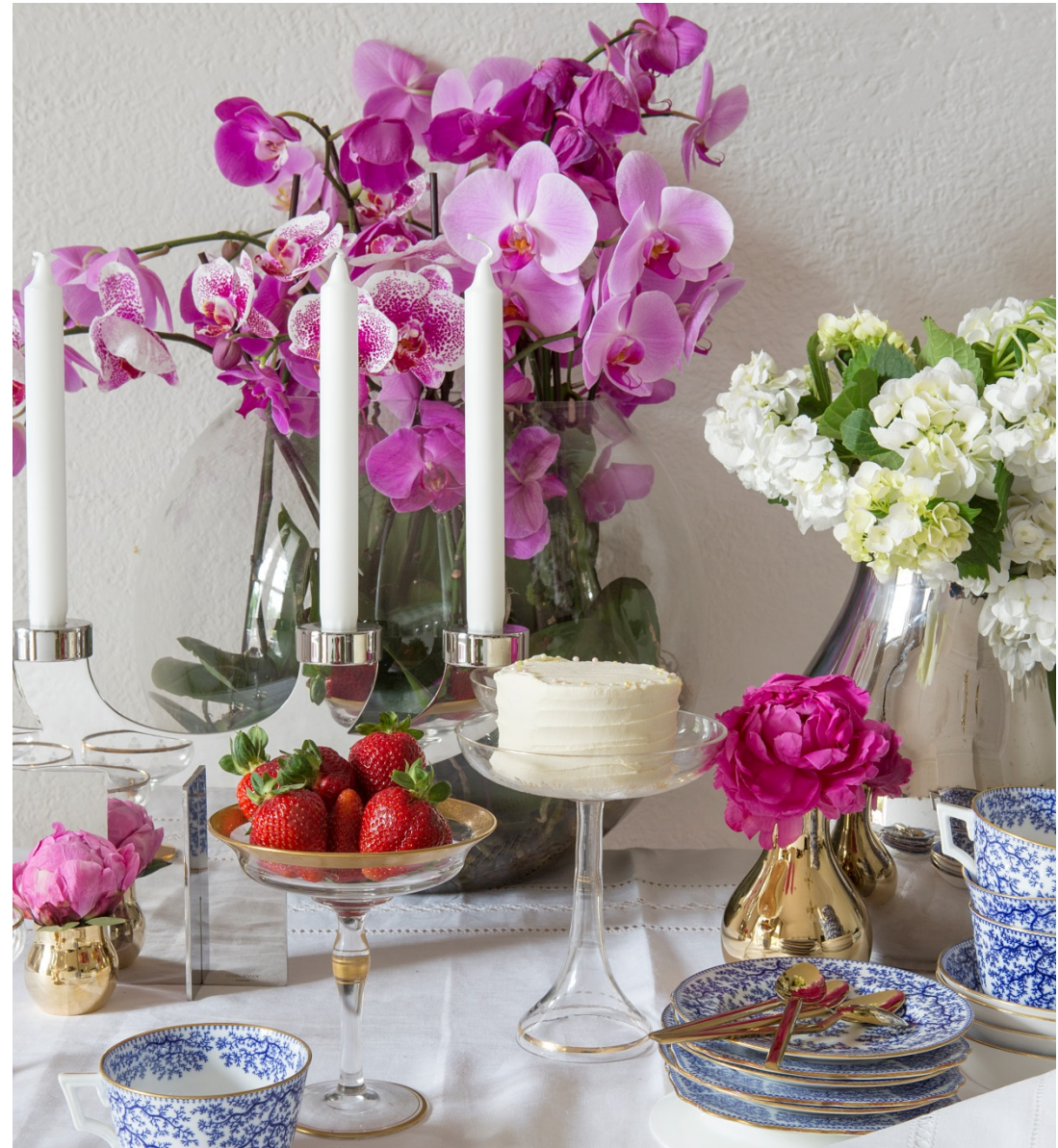
Tablecloth and napkins