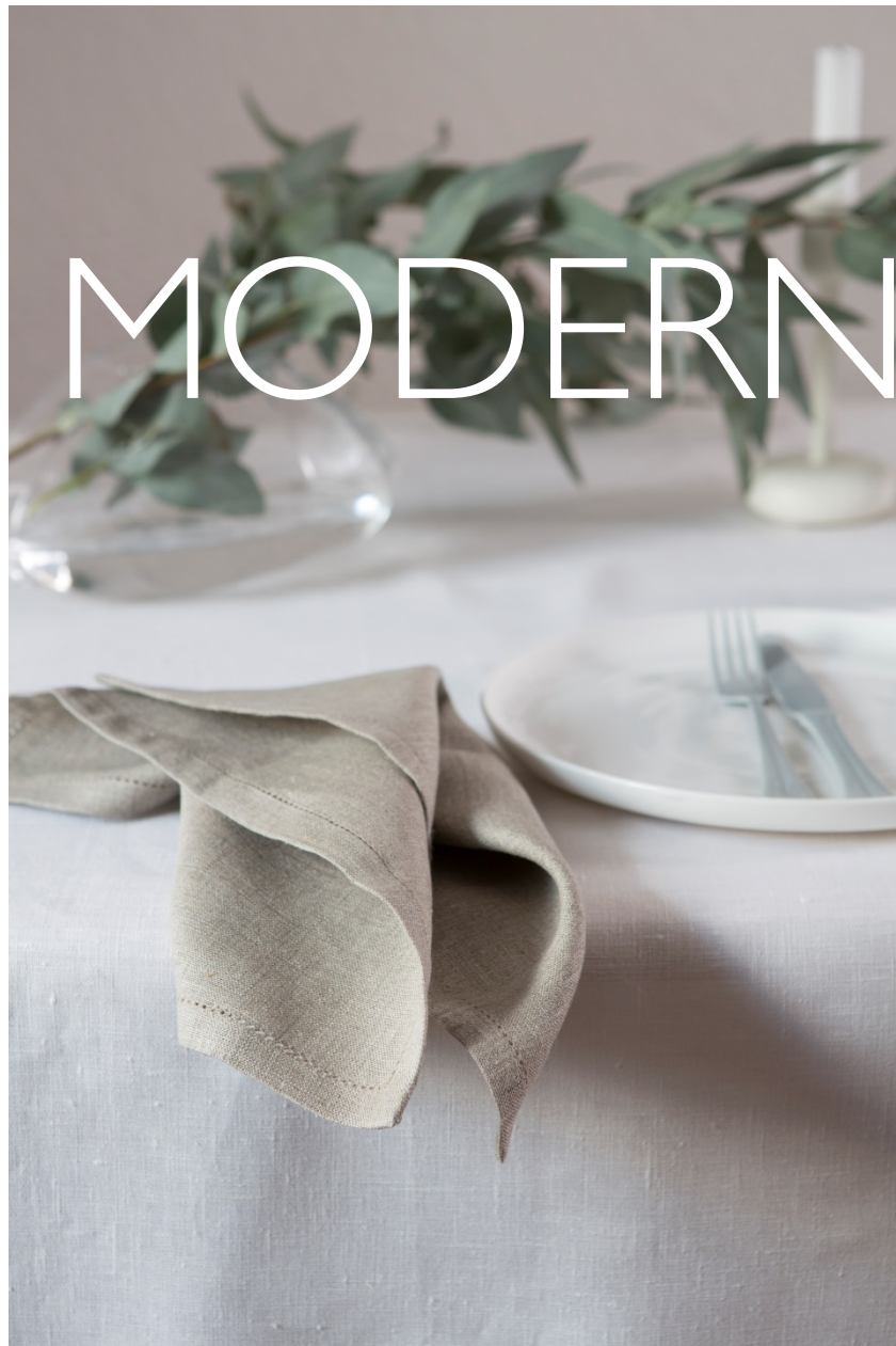
Optical White tablecloth with Natural Flax napkin