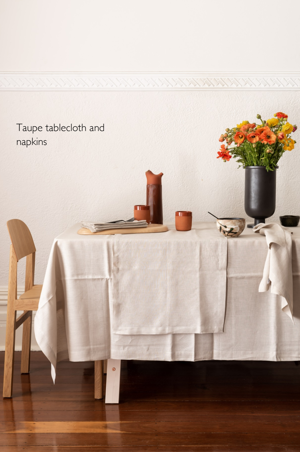
Taupe tablecloth and napkins