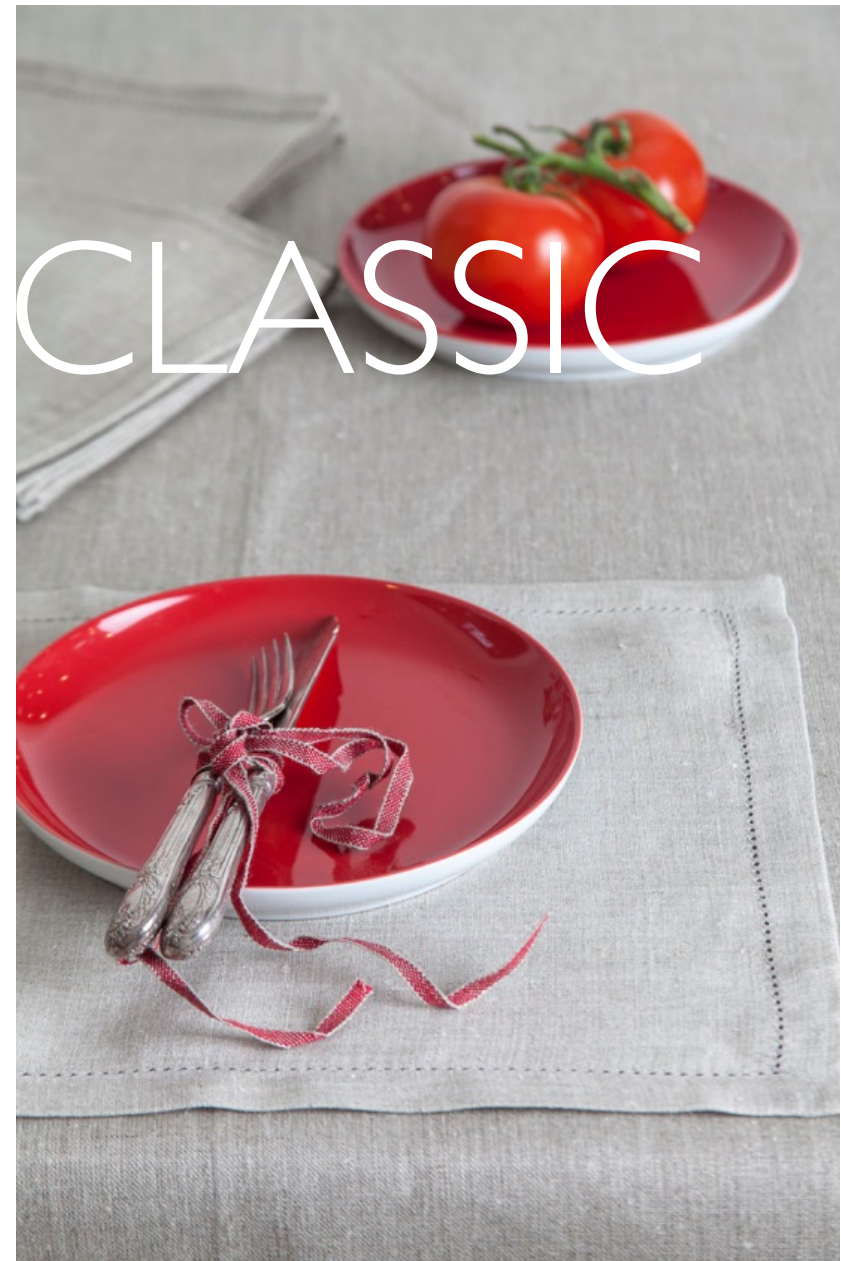
Natural Flax tablecloth, napkin and placemat