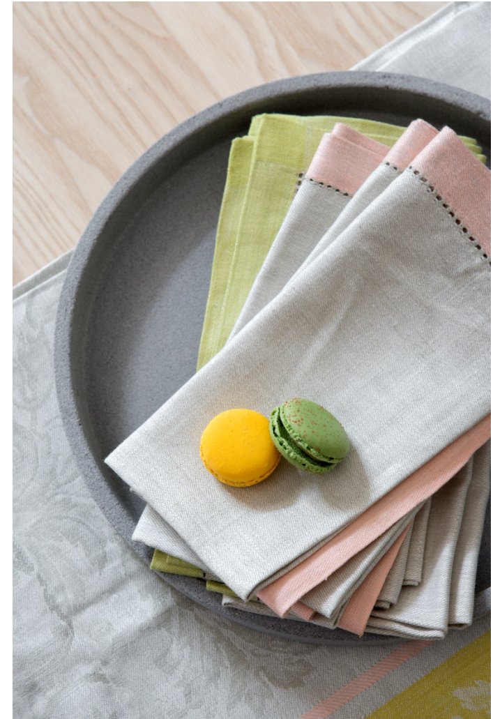
Pastel Peach/Lime and Pastel Blue/Green napkins