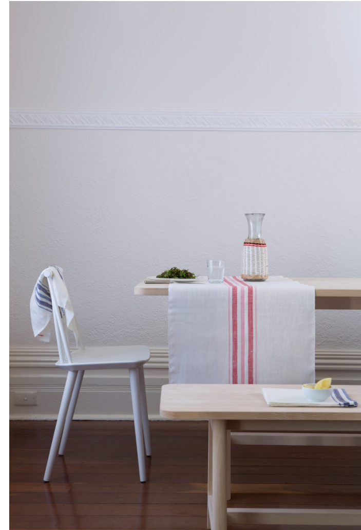
Red Striped runner, Blue Striped napkin