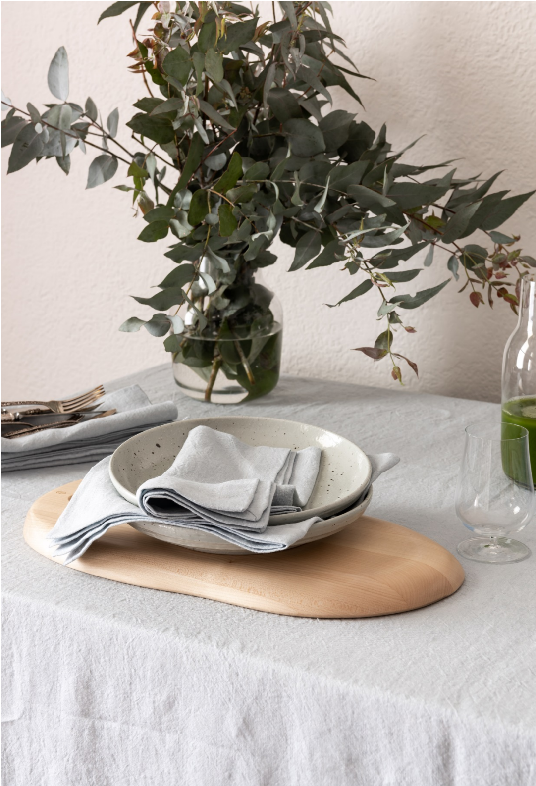
Duck Egg tablecloths and napkins