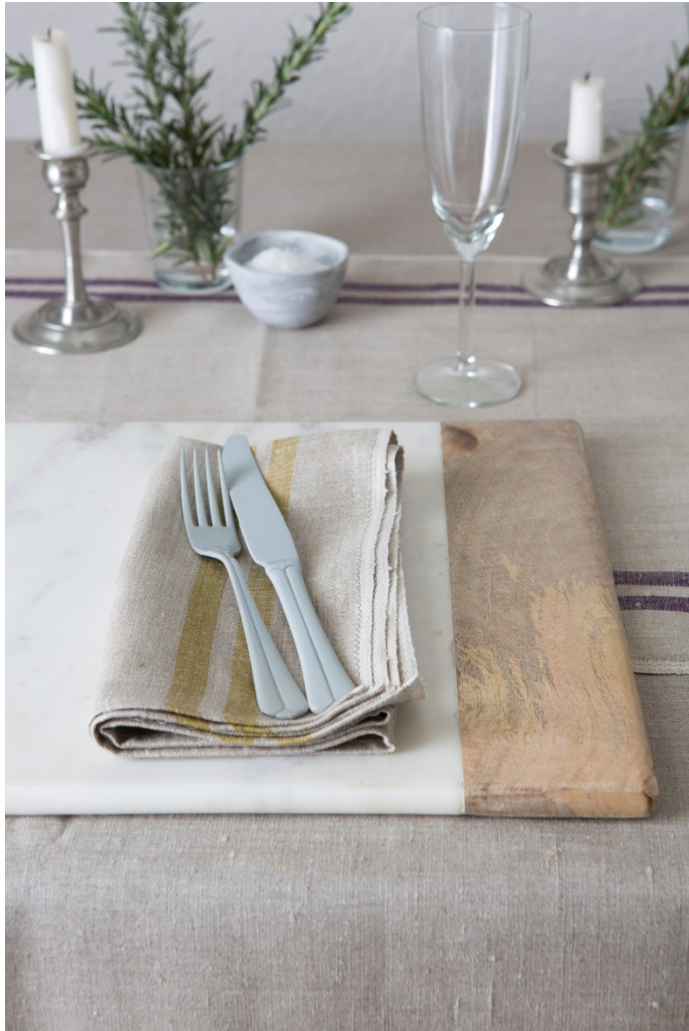
Natural with Bronze Stripes napkin