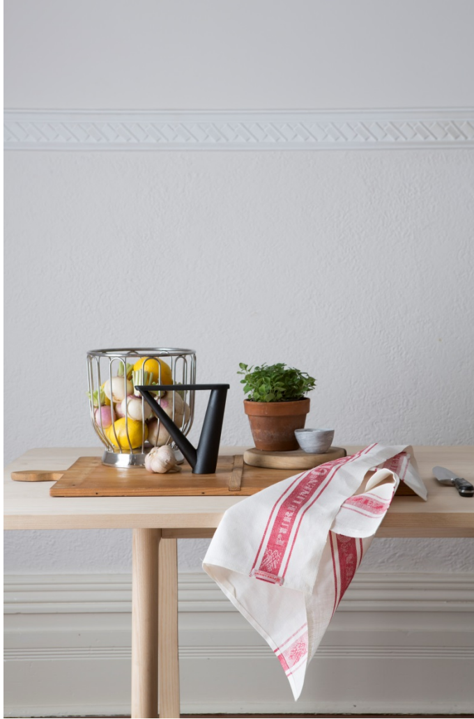
Red tea towel