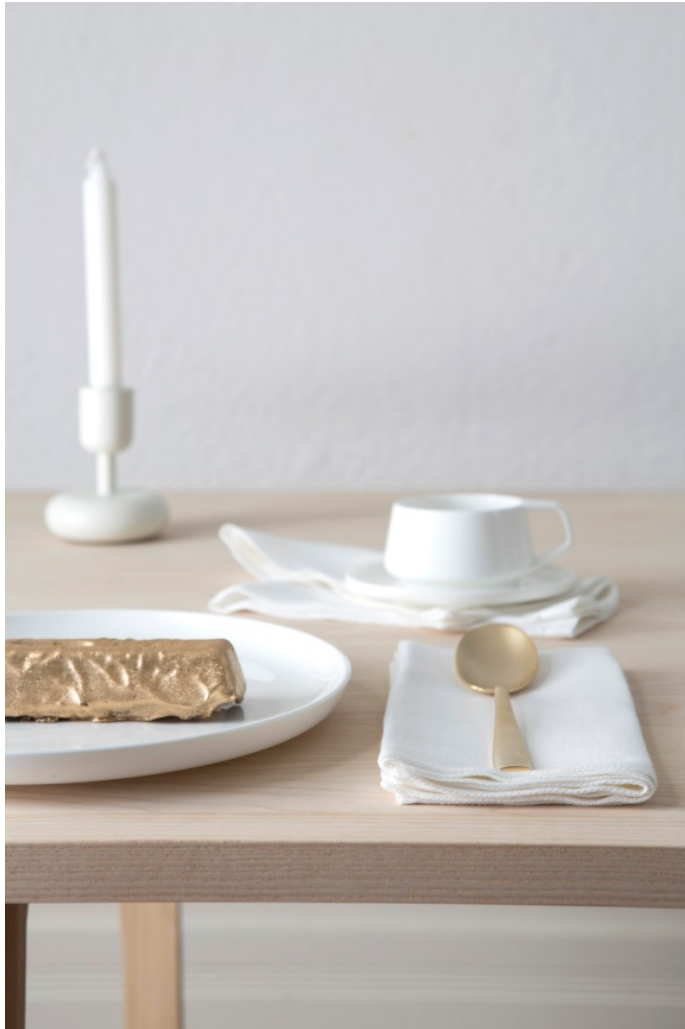
Optical White napkins