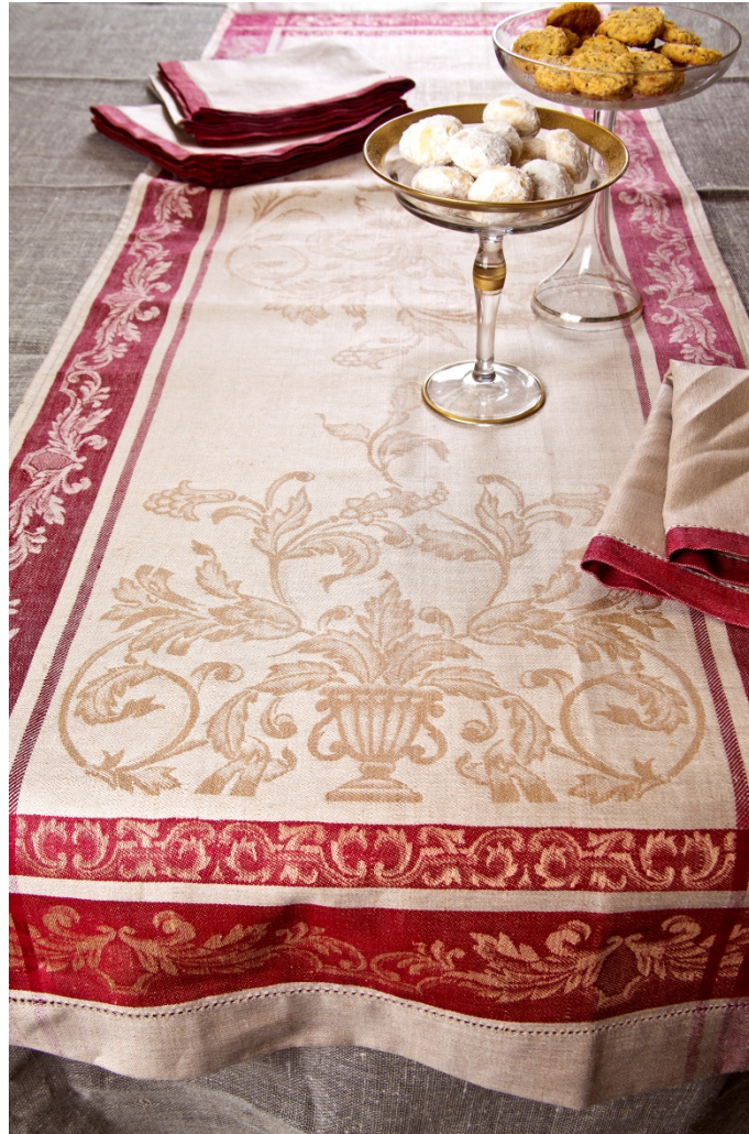
Gold/Red runner and napkins