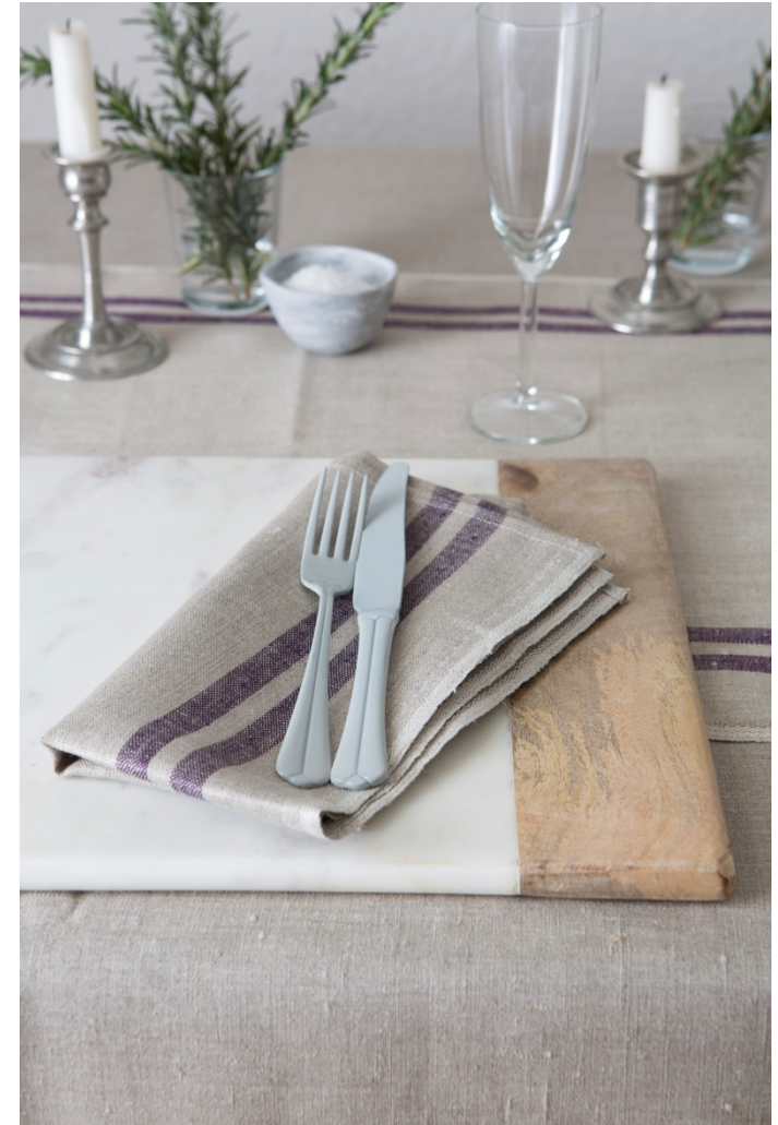
Natural with Indigo Stripes napkin