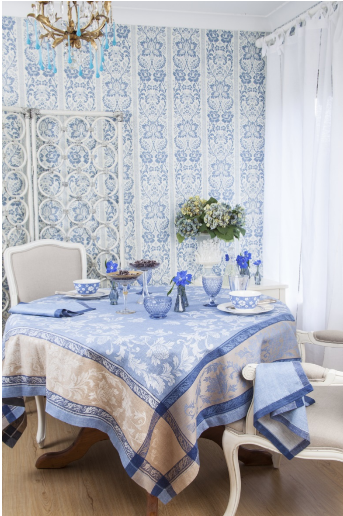
Wedgwood Blue tablecloth and napkins