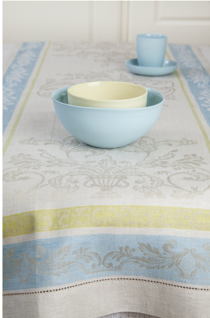
Pastel Blue/Green runner