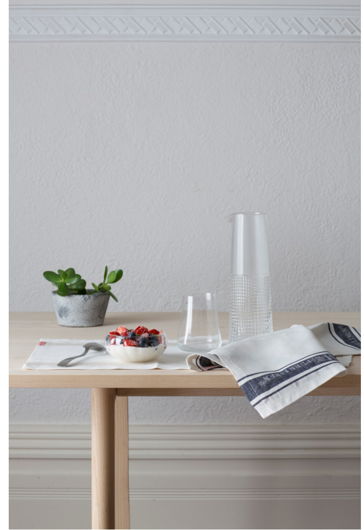
Natural placemat, Black napkin