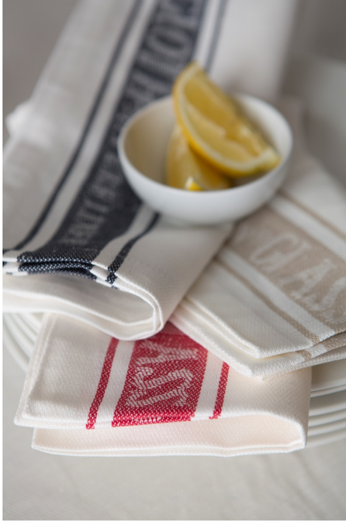
Black, Natural and Red napkins