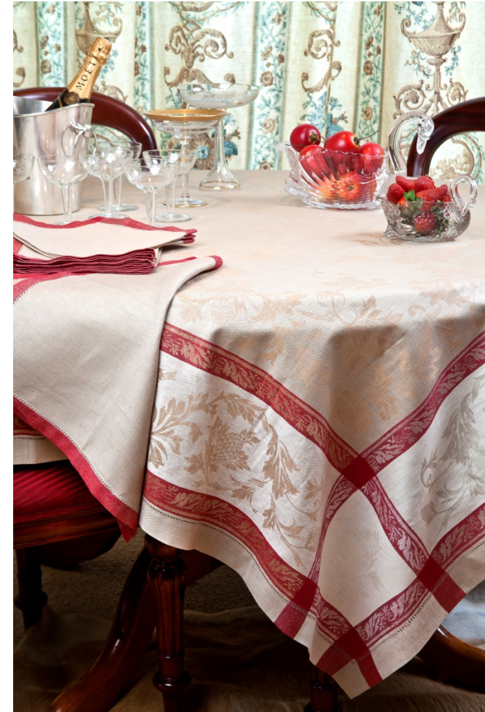
Gold/Red tablecloth and napkins