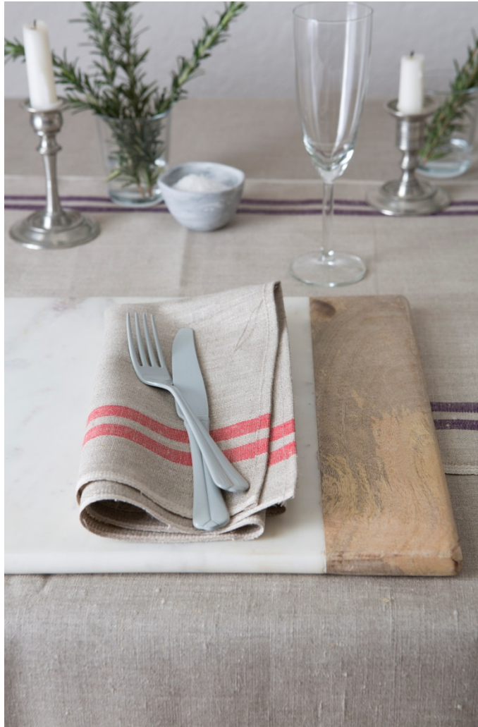
Natural with Red Stripes napkin