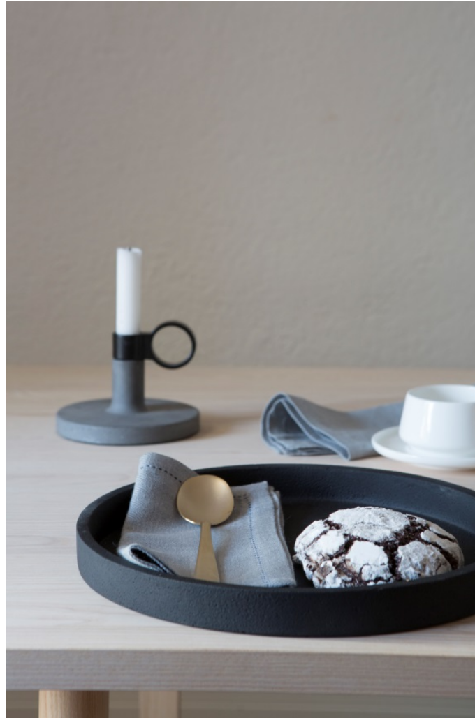
Light Pewter napkins