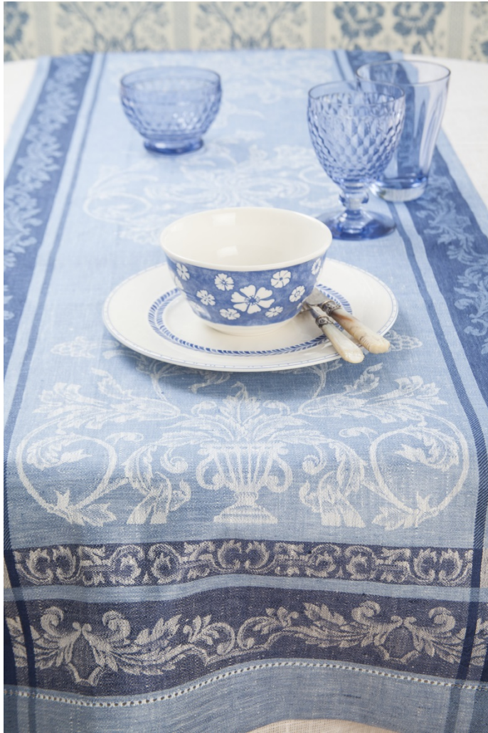
Wedgwood Blue runner