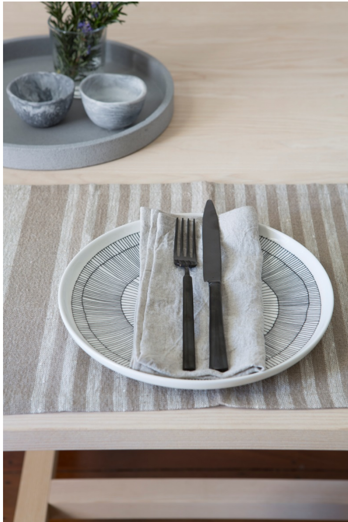
Natural Striped Placemat